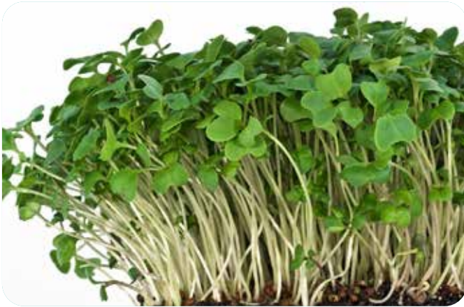
Broccoli - Sprouting

One of the most popular of all sprouting vegetables, sprouting broccoli is simple to grow. With pale stem and heart-shaped green cotyledons, it's one of the better varieties to start with for beginning growers.