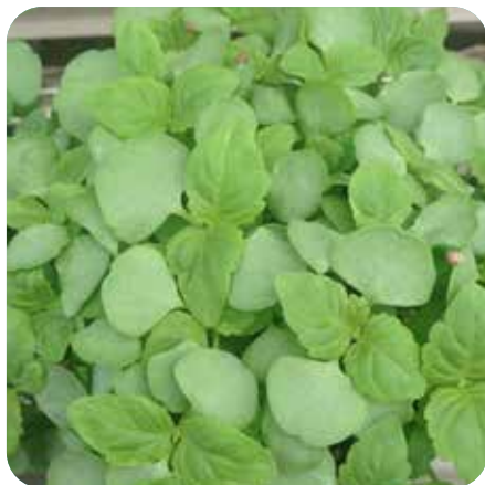
Shiso - Green

One of the most popular herbs in Japanese cooking, Green Shiso (or perilla) is slightly spicier with more cinnamon undertones compared with Red Shiso. Curved cotyledons with serrated true leaves.