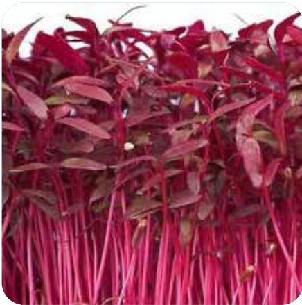
Amaranth - Red Garnet

One of the most striking of all micro-herbs. The fluorescent pink stem, topped with silvery pink, elongated cotyledons are the reason this is one of the staples in all micro-herb operations. Mild, spinach like flavour and excellent vigour.