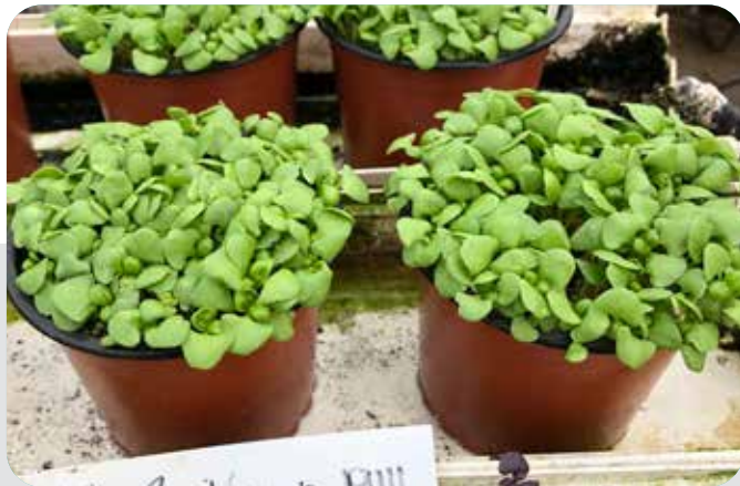
Basil - Genovese

Italian Genova type basil with vibrant green, apple shaped cotyledons and large dark green true leaves with a slightly savoy texture. An excellent option for micro-herbs due to its flavour and beautiful aroma.