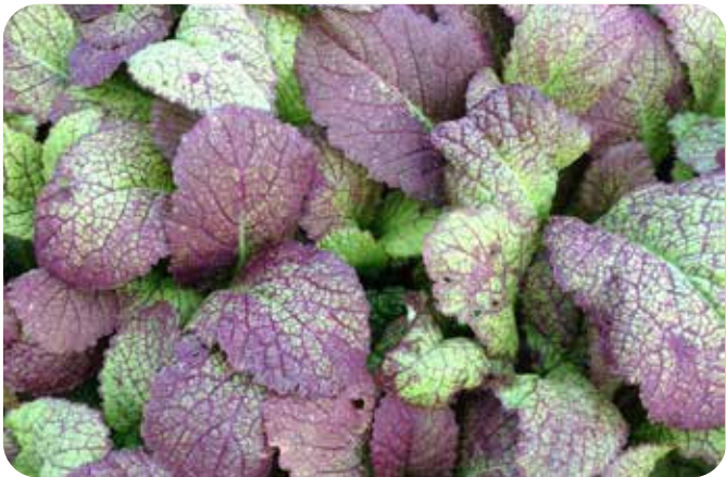
Mustard - Red Giant

Red mustard with an excellent colour and uniformity at cotyledon stage and a strong mustard flavour. True leaves are dark red and lightly serrated at maturity.