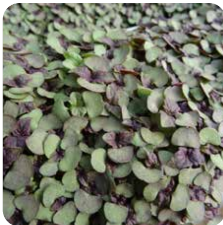
Sage Shiso - Red

One of the most popular herbs in Japanese cooking, Green Shiso (or perilla) is slightly spicier with more cinnamon undertones compared with Red Shiso. Curved cotyledons with serrated true leaves.