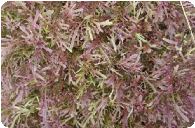
Mustard - Flame Trees

Vigorous growth with upright habit. Attractive serrated leaves with a mild mustard flavour, purple colour starts developing at the cotyledon stage. Used for salad mix.