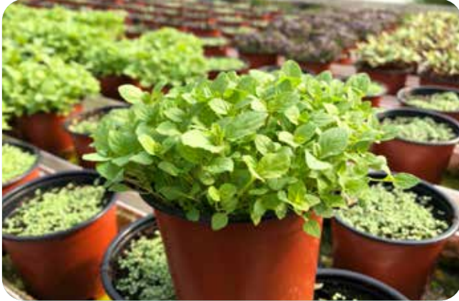
Mint - Peppermint

With a sharp, intense flavour, Peppermint (which contains Menthol) adds a lovely cooling sensation in dishes. Peppermint tends to have larger leaves and more of a creeping habit than Spearmint. Peppermint is extremely tiny seed and slower to establish than most micro-herbs.