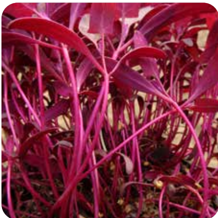
Orach - Red

With a mild, sweet flavour and a sweet taste, Spearmint is an excellent addition to dessert dishes. Spearmint tends to have smaller leaves and more of an upright habit than Peppermint. Spearmint is extremely tiny seed and slower to establish than most micro-herbs.