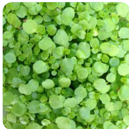
Watercress - True Water

Thyme has beautiful small leaves on upright stems. Sprigs of thyme, when grown as micro-herbs, make for a superior garnish compared with field grown products as they are softer and sweeter without the woody stems of standard Thyme.