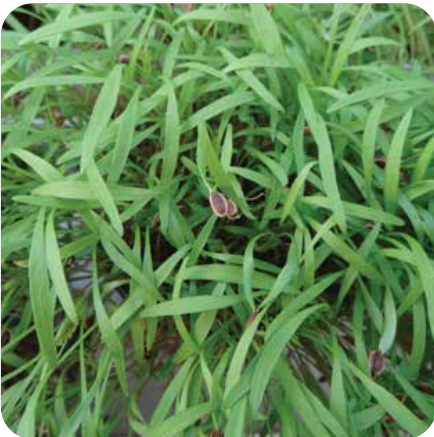
Dill - Bouquet

Beautifully lobed, fine-leaved, green micro-herb. Curled Wasabi Cress has a spicy flavour and is used in salads, usually eaten raw.