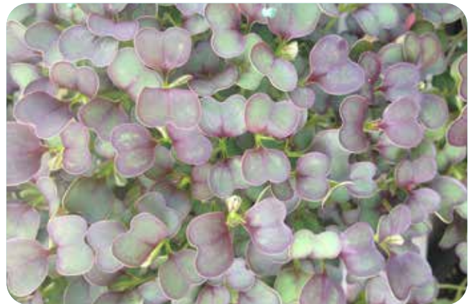
Tatsoi - Purple Royale F1

A traditional leaf mustard with a strong flavoured light red leaf. Attractive red and green mottled cotyledons. Mostly used in micro-herbs.