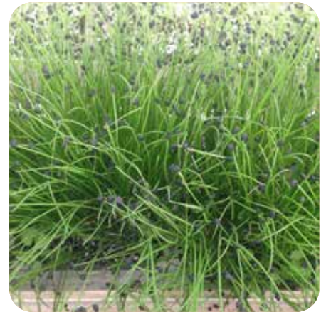
Chives - Garlic

A longer stemmed micro-herb with finely curved green cotyledons. The large, narrow, dark seed coat often remains attached for a striking contrast. It has a sweeter and more delicate flavour than parsley and finer in appearance with a faint aniseed flavour.