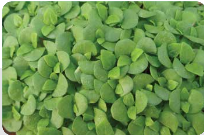
Basil - Greek

Italian Genova type basil with vibrant green, apple shaped cotyledons and large dark green true leaves with a slightly savoy texture. An excellent option for micro-herbs due to its flavour and beautiful aroma.