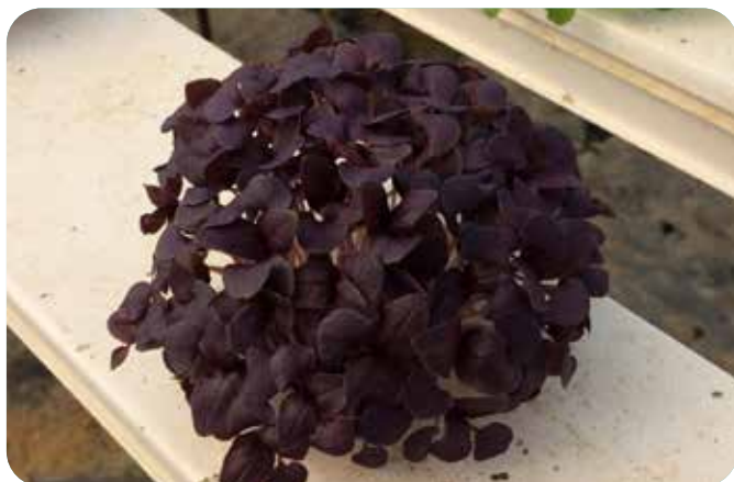
Basil - Purple Fire

A smaller leaved more compact plant than Italian basil. Green curved cotyledons with small pointed true leaves. Sweeter and more subtle flavour than Italian basil.