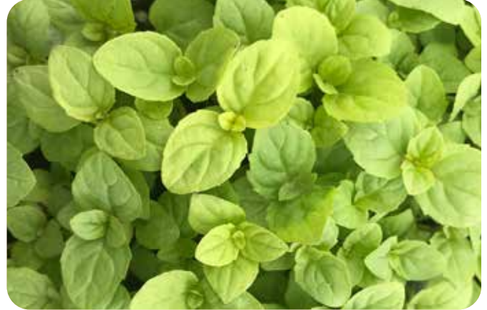
Mint - Spearmint

With a sharp, intense flavour, Peppermint (which contains Menthol) adds a lovely cooling sensation in dishes. Peppermint tends to have larger leaves and more of a creeping habit than Spearmint. Peppermint is extremely tiny seed and slower to establish than most micro-herbs.