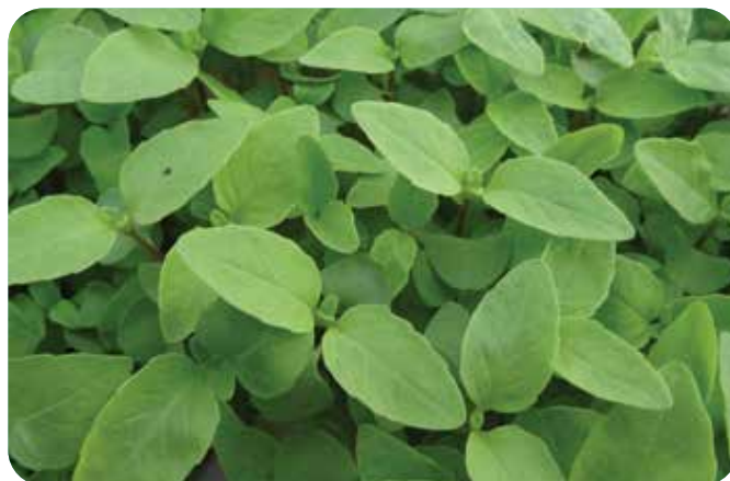
Basil - Thai

A premium purple leaf basil with excellent uniformity. Perfect for pot production and micro-herbs. Excellent uniformity at the micro leaf stage with deep purple coloured cotyledons and nice glossy true leaves.