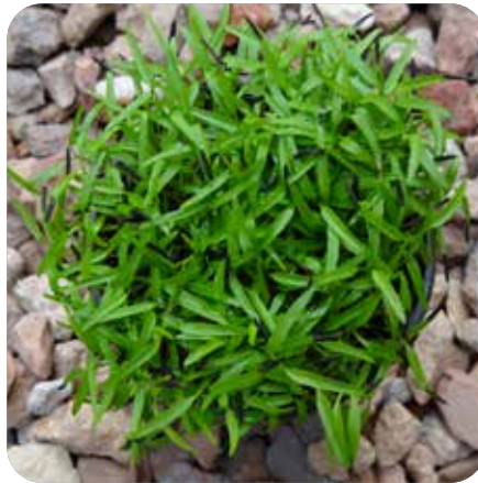
Chervil - Curled

A longer stemmed micro-herb with finely curved green cotyledons. The large, narrow, dark seed coat often remains attached for a striking contrast. It has a sweeter and more delicate flavour than parsley and finer in appearance with a faint aniseed flavour.