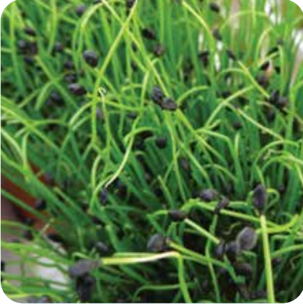
Chives - Medium Onion

Long, narrow leaves with a strong onion flavour. Black seed coat remains attached to the leaf tip for an attractive micro-herb.