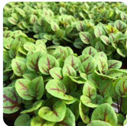
Sorrel - Micro-Vein

A difficult flavour to describe, reminiscent of curry powder, with hints of anise, cinnamon and coriander. Fairbanks Red shiso is the darkest red and most consistent red shiso variety available. Popular in Japanese and south-east Asian cuisine.