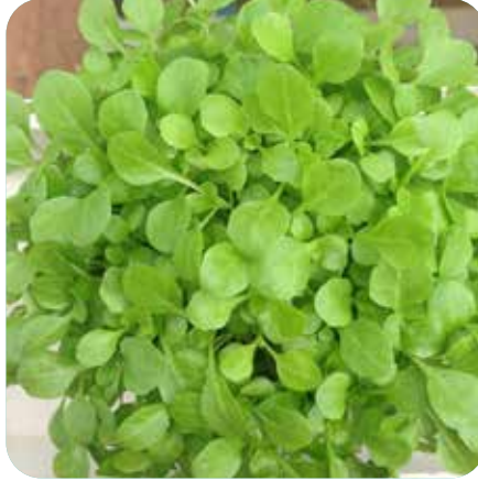
Corn Salad - Mache

Long, narrow leaves with a strong onion flavour. Black seed coat remains attached to the leaf tip for an attractive micro-herb.