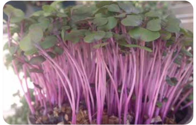
Cabbage - Red Sprouting

One of the most popular of all sprouting vegetables, sprouting broccoli is simple to grow. With pale stem and heart-shaped green cotyledons, it's one of the better varieties to start with for beginning growers.