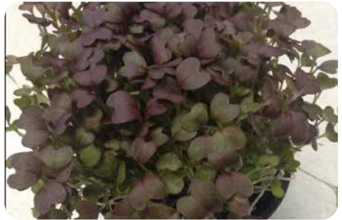
Mustard - Red Dijon

Vigorous growth with upright habit. Attractive serrated leaves with a mild mustard flavour, purple colour starts developing at the cotyledon stage. Used for salad mix.