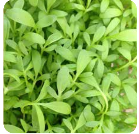
Cress - Curled Wasabi

French vegetable, grown for baby leaf or micro-herb. Spinach-like growth habit, with a delicate and nuttier flavour than spinach. Mache continues to thrive through cold temperatures.